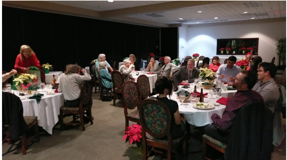
2017 Tampa Bay Chapter Holiday Party at The Temple Terrace Golf and Country Club