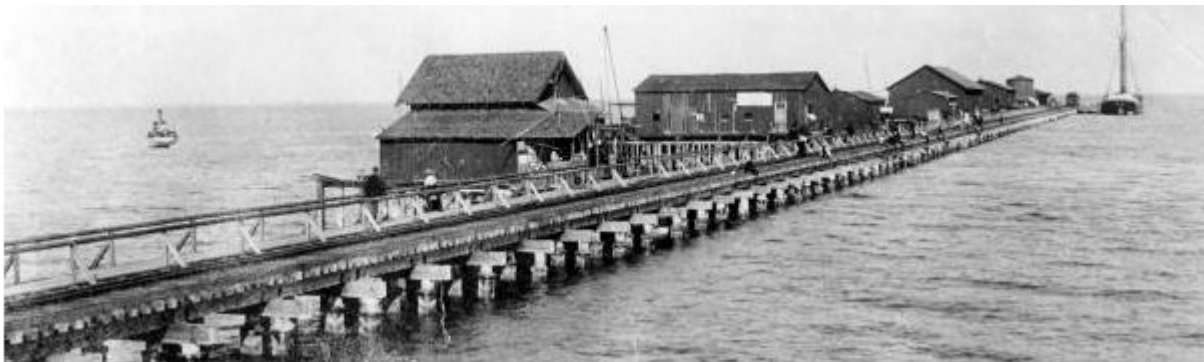
Railroad pier extending into Tampa Bay—St. Petersburg circa 1903