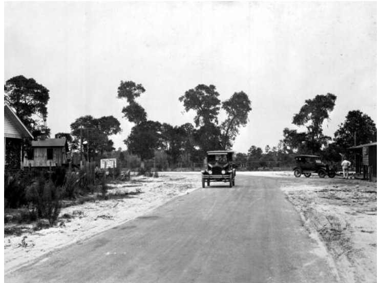
Odessa circa late 1920s