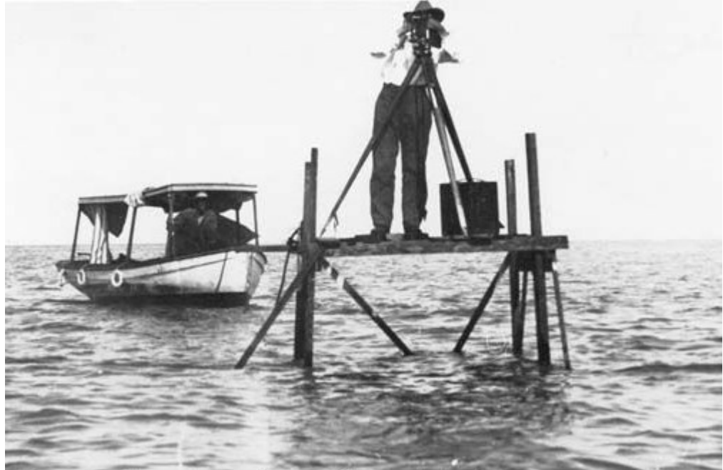
Surveying for the railroad bridges in the Florida Keys circa 1906